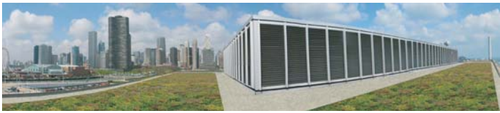
Digital rendering with planned green roof