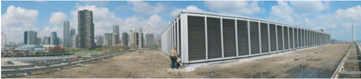
Existing roof conditions