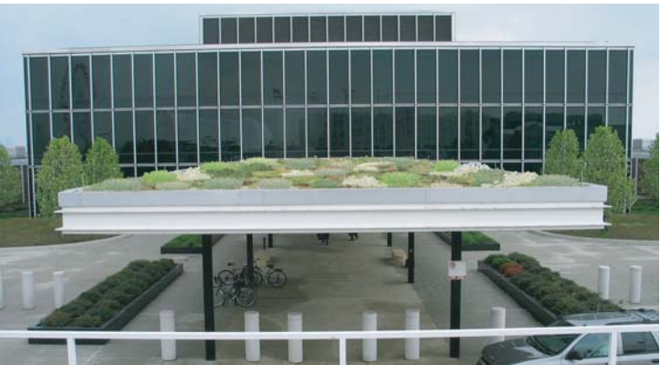
Digital rendering for canopy green roof